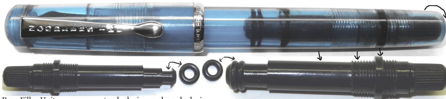
Rear Filler Unit -remove counterclockwise, replace clockwise

To fill: remove both cap and end cap, cover the nib and feed completely with ink and turn the filler knob counterclockwise until it stops and then clockwise until it stops, remove pen from ink and clean off excess with a paper towel. Occasionally fill/empty/rinse pen with 1/3 rd ammonia and 2/3 rd tap water to clean.